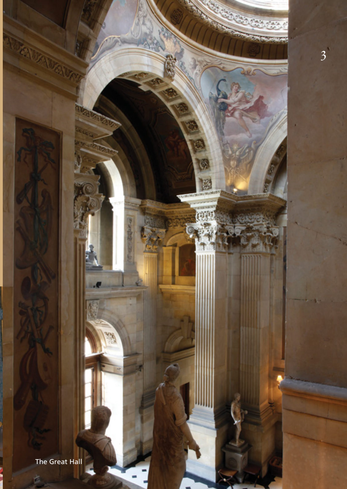
The Great Hall