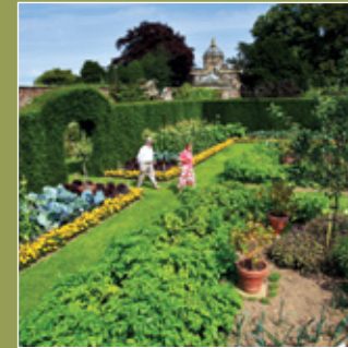
Ornamental vegetable garden

Within the 18th-century walled garden, enjoy the heady scent of the rose collection in high summer, while at harvest-time the ornamental vegetable garden yields plentiful produce, much of which is used by our chefs or sold through our farm shop.