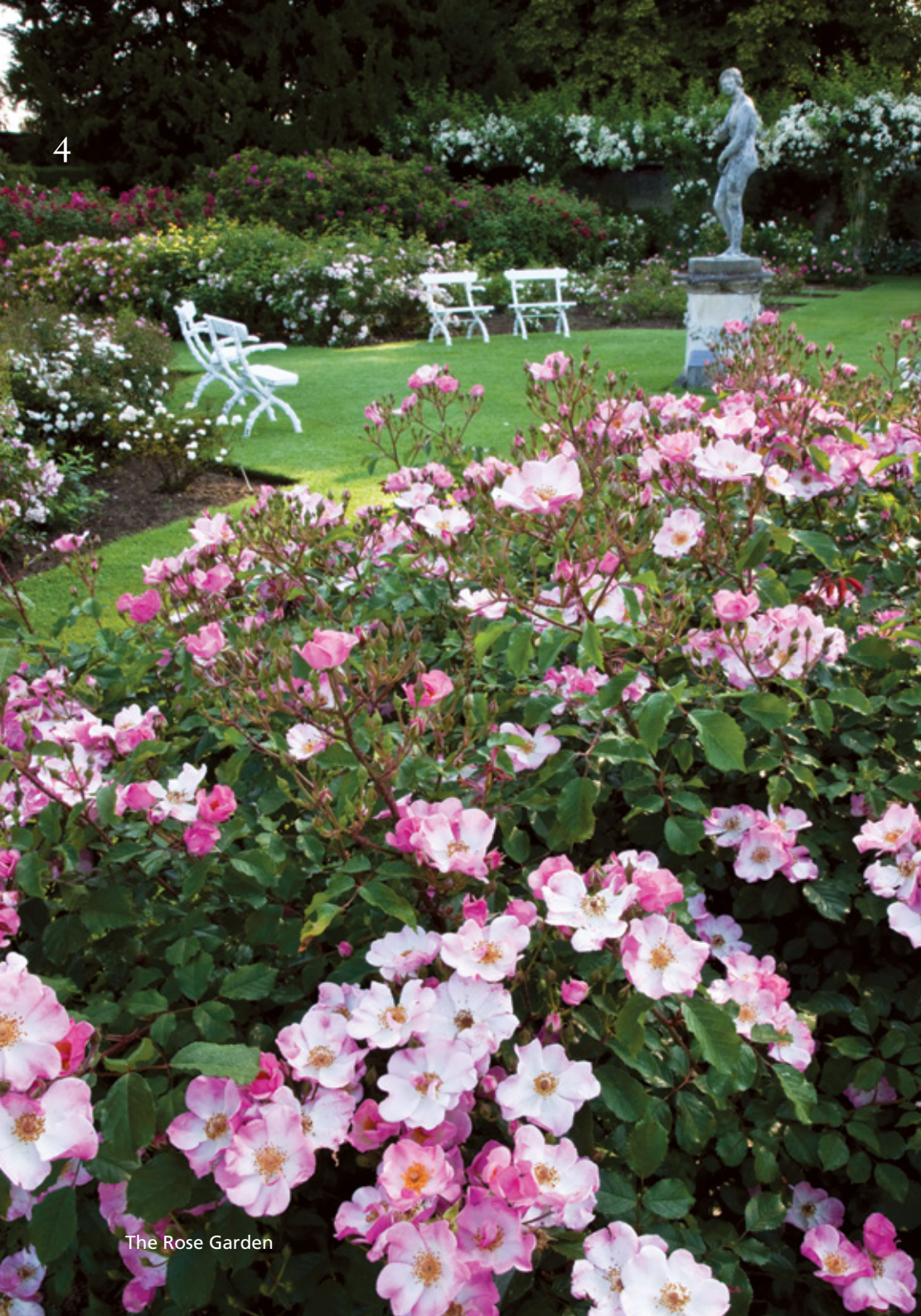
The Rose Garden