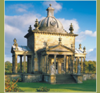
The Temple of the Four Winds

Explore the landscape further by joining a guided tour. These run daily between March and October, and are included in the normal admission price.