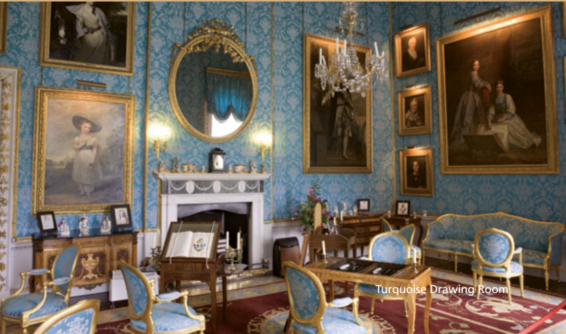
Turquoise Drawing Room

Information boards are located in most rooms, highlighting objects of particular interest, while the illustrated guidebook is ideal for anyone wanting a more in-depth look at the history of the house, family and collections.