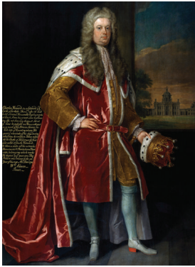
3rd Earl of Carlisle

each putting their own mark on the House and Grounds.