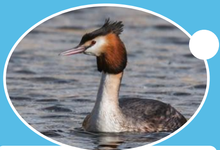
Great Crested Grebe An elegant waterbird with ornate head plumes, on land they are clumsy because their feet are so far back on their bodies.