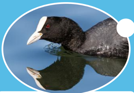
Coot All-black and larger than its cousin, the moorhen. A distinctive white beak and 'shield' above the beak which earns it the title 'bald'.