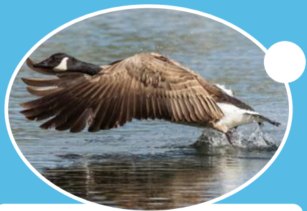
Canada Goose A large goose, with a distinctive black head and neck, and large white throat patch.

The Great Lake is home to a wide variety of birds. See what you can spot out on the water and on the lake banks!