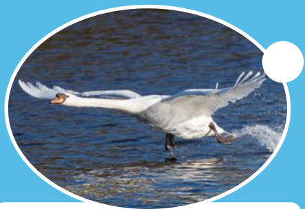
Mute Swan Large white water bird with long S-shaped neck, and an orange bill with black at the base of it.