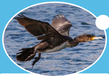
Cormorant A large and conspicuous waterbird with an almost primitive appearance. It is often seen standing with its wings held out to dry.