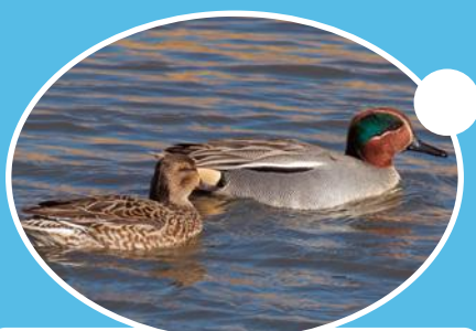
Teal Males have chestnut-coloured heads, broad green eye-patches, grey flanks and a black-edged yellow tail. Females are mottled brown.