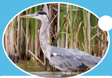
Grey Heron Tall, with long legs and a long beak. They stand with their neck stretched out, looking for food, or hunched with their neck bent over.