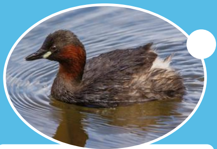
Little Grebe A small grebe which often appears to have a 'fluffy' rear end. In summer it has a bright chestnut throat and cheeks.