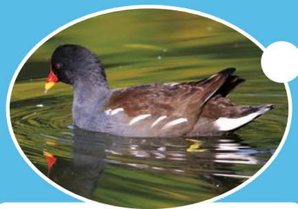
Moorhen Red and yellow beak and long, green legs. Seen close-up they have a bluish-black belly, with white stripes, dark brown back and wings.